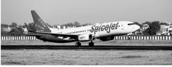
The airline is working to shift its systems to a secured server

Responding to the issue, SpiceJet said: "Certain